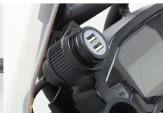
Built-in LED (blue) remains lit when powered on.